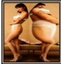
Anorexia/Bulimia is a state of mind

According to the National Institute of Mental Health, an eating disorder is present when a person experiences severe disturbances in eating behavior, such as extreme reduction of food intake or extreme overeating, or feelings of extreme distress or concern about body weight or shape.